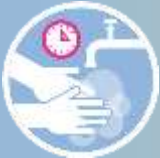
ngaa bulol ku