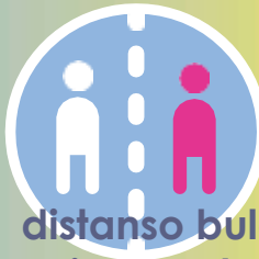
distanso bula e nying mo tema